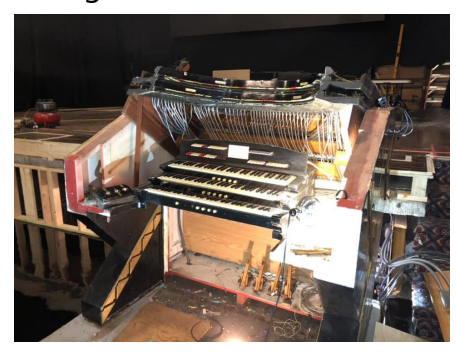
Starting console the removal