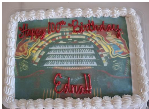
Happy Birthday Edna!