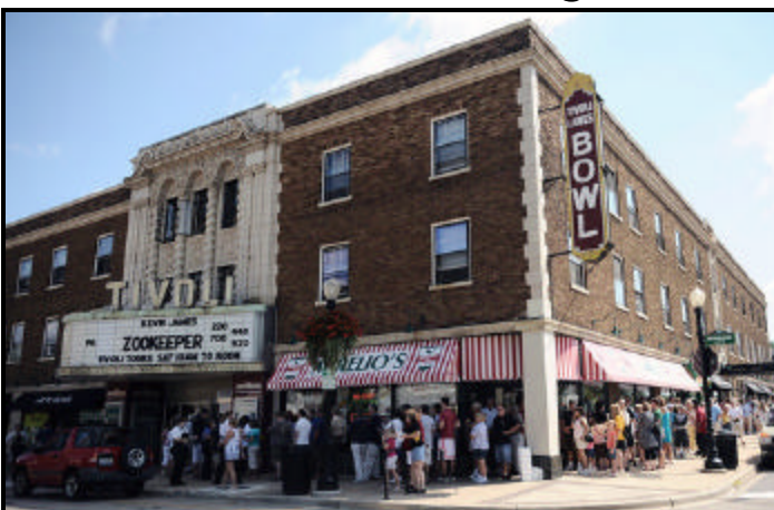
Just a few of the estimated 500 fans who lined up outside of the Tivoli Theatre in Downers Grove, IL on August, 13th during the theatre's open house. Story and photos on page 2.