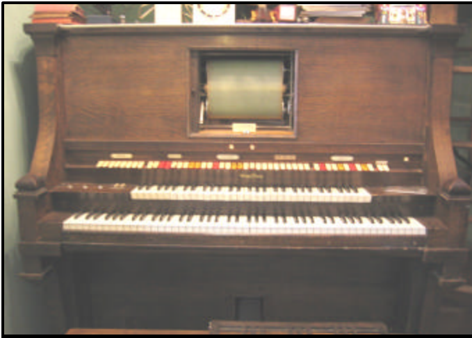
The roll playing console to Wurlitzer Opus 471, originally installed in 1921 in the Temple Theatre in Hammond, Ind.