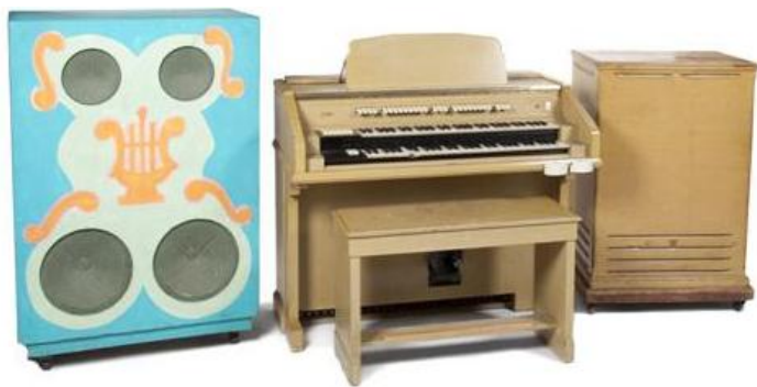
This photo provided by the auctioneer shows the Conn organ and speakers believed to be used on WGN-TV's "Bozo's Circus" which sold for $3,660.00 including auction fees.